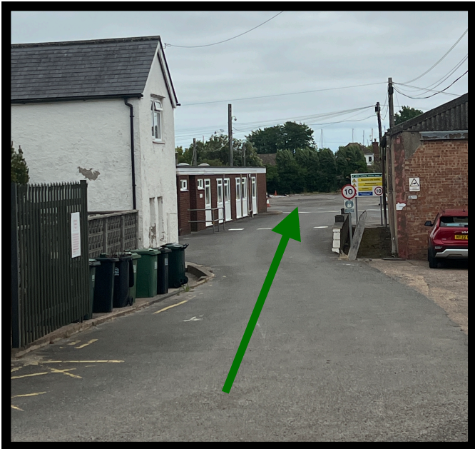
Pic C - Drive to the end of the yard and turn right