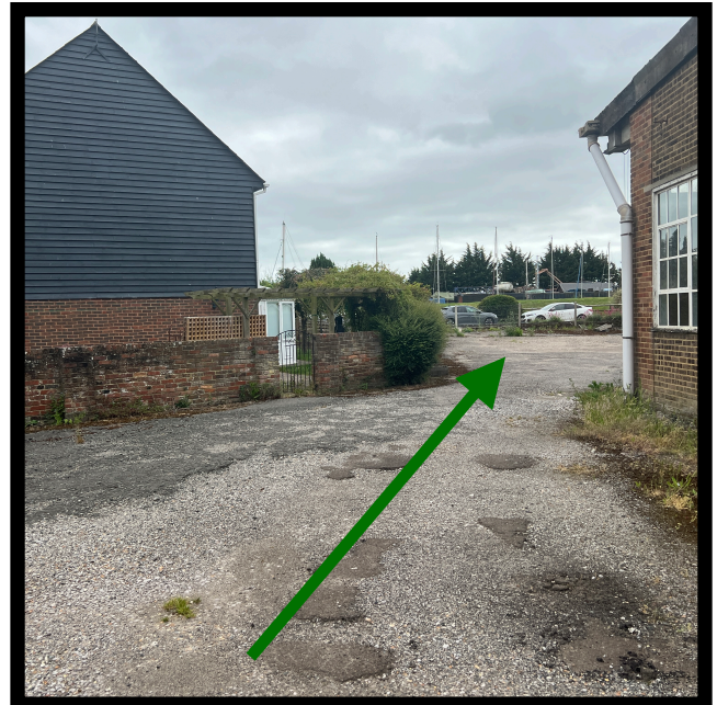
Pic D - Park up by Bide Cottage and walk through the back gate