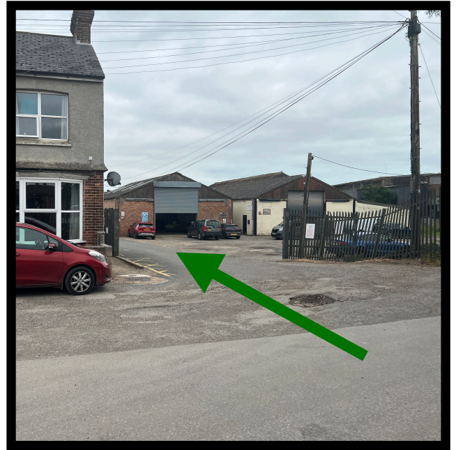
Pic B - Turn left after the terrace of houses