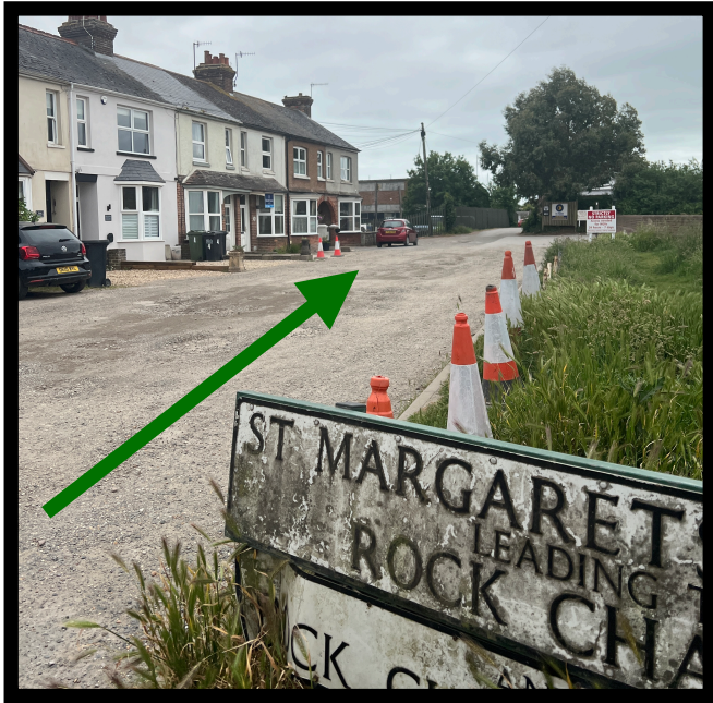
Pic A - Turn off South Undercliff onto St Margaret's Terrace